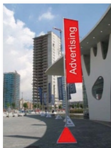
Mast: 1,500 EUR

Unique opportunity to be the first to impress visitors