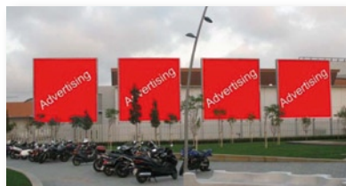
Fence (4 units): 24,000 EUR

SIL2012 BARCELONA For further information, please contact with SIL organization at marketingsil@el-consorci.com