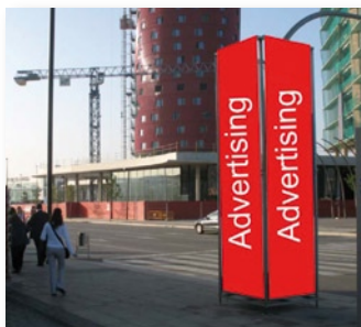
Quadrangular tower: 2,000 EUR